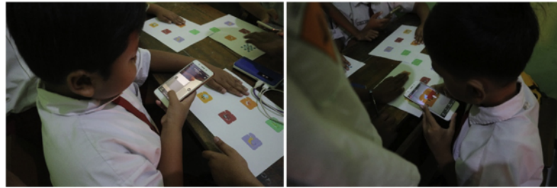
Figure 3. Students using 3Dmetric.